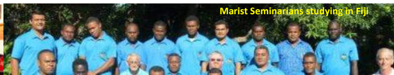
Marist Seminarians studying in Fiji