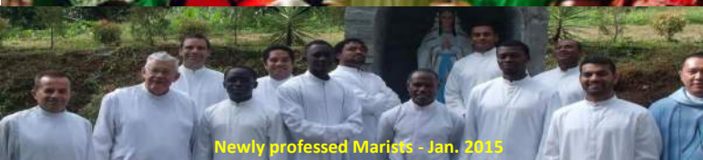
Newly professed Marists - Jan. 2015