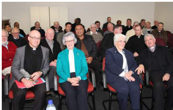
Clergy Conference gathering