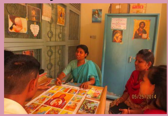
Sr. Ruma smsm in Bangladesh conducting inter-religious marriage preparation