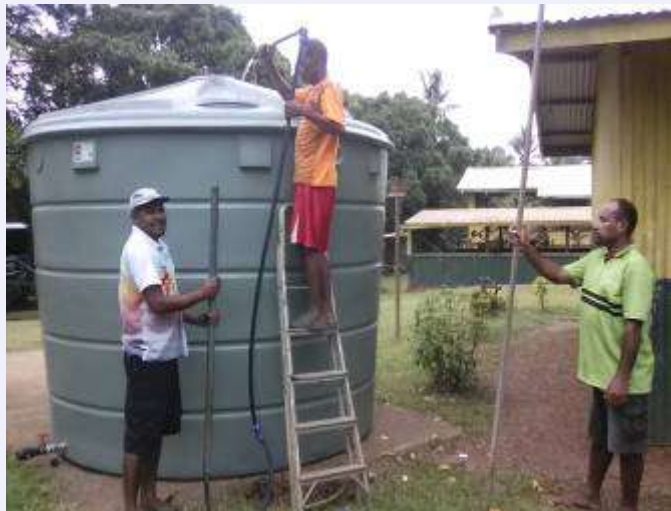
A new water tank