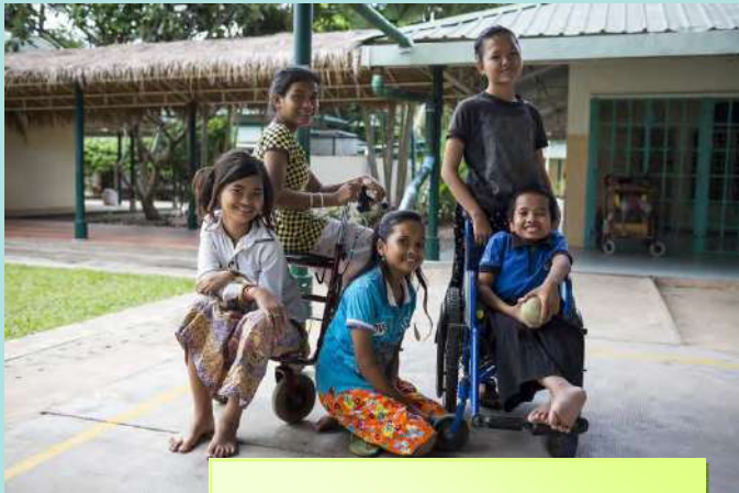
After graduating, these students will be offered a placement at La Valla so they can continue their education.