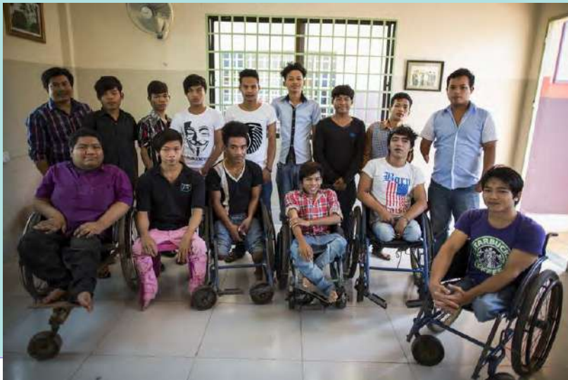
These students will transition into the La Valla village once their training is completed.

La Valla seeks to empower young Cambodians with disabilities through education and training leading to employment and self-sufficiency.