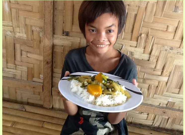
A plate full of happiness, Indigenous girl, Davao, Philippines

With our thanks for your generous support.