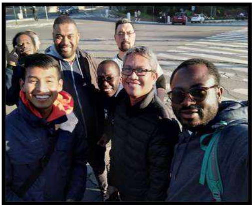
The chefs for Christmas