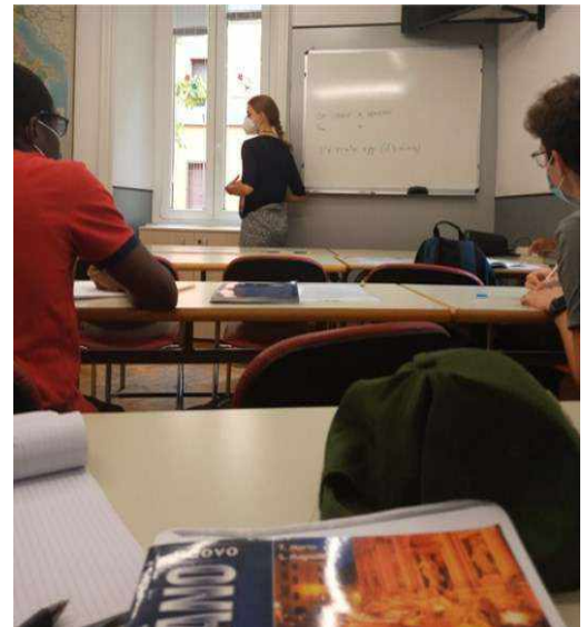
L'inizio Della Lezione