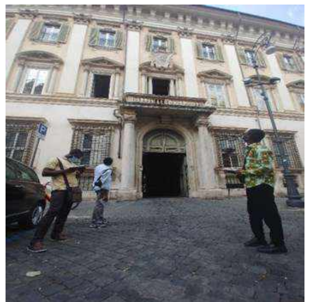
The Church of the Immaculate Conception