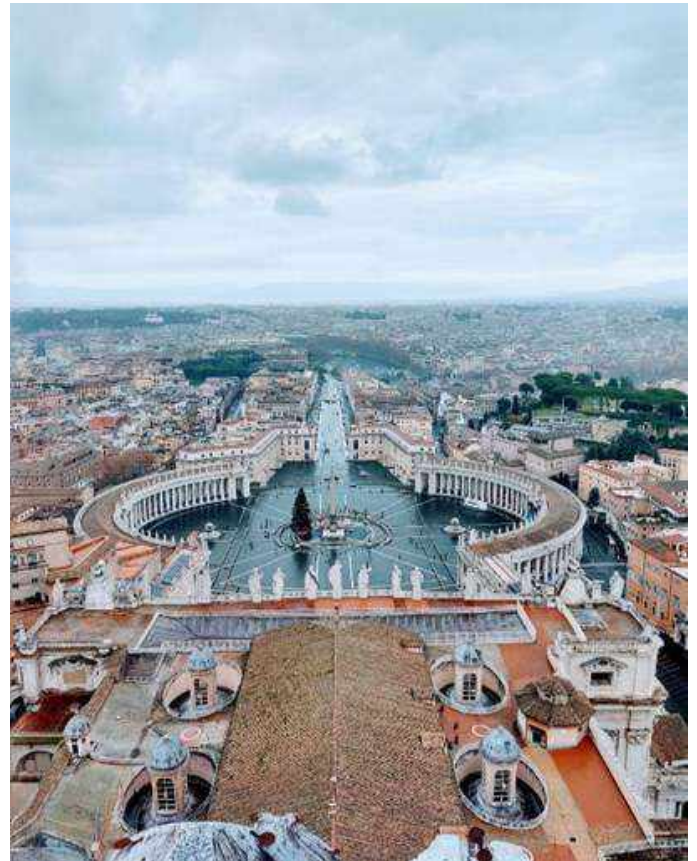
The view from the top by Christian!