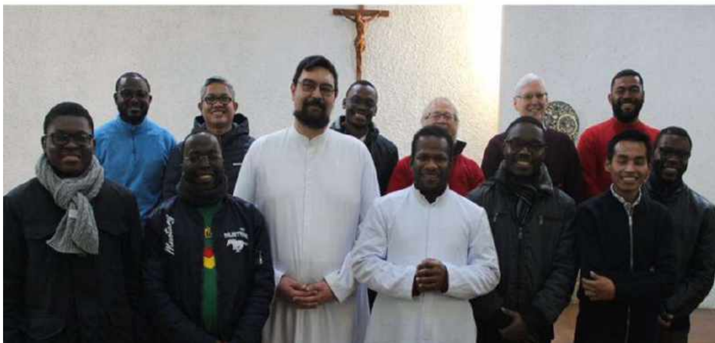
Casa di Maria community January 2022

Bulletin of the Marist International Theologate, March 2022