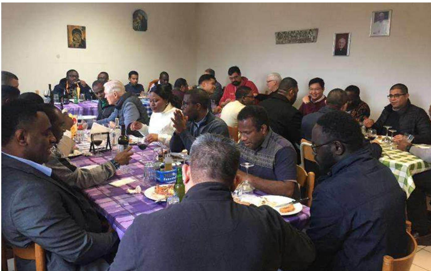
A full house for Christmas lunch