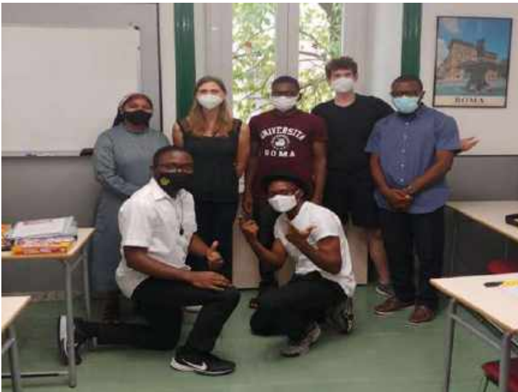
Compagno di Scuola