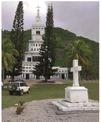
The Basilica on Futuna

Pray the Prayer for Vocations as on Day One