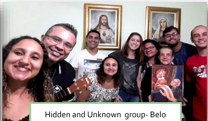
Hidden and Unknown group- Belo Horizonte - MG