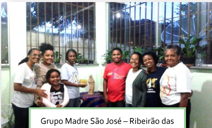
Grupo Madre São José – Ribeirão das Neves - MG