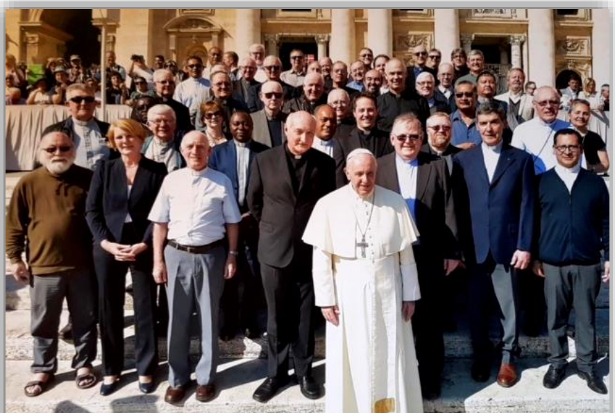
Chapter 2017 at the audience with Pope Francis