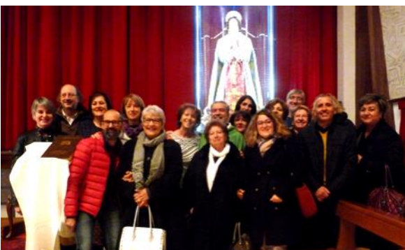
The new group with the statue of Maria SS della Libera, patron saint of Pratola Peligna.

The inscription on the celebration cake: walking with Mary ... the journey is not over.