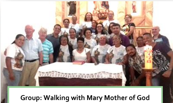
Group: Walking with Mary Mother of God Palmas de Monte Alto - BA

We pray that we all live for the greater glory of God and the honor of Mary.