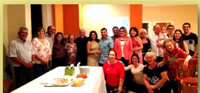
Magnificat Group of Curitiba - PR