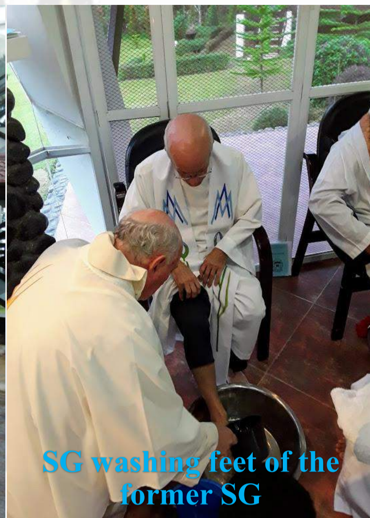
SG washing feet of the former SG