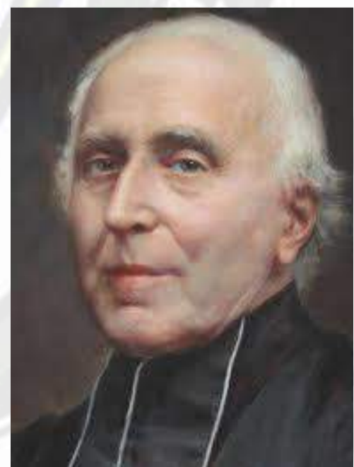
Jean Claude COLIN: Founder of the Society of Mary.