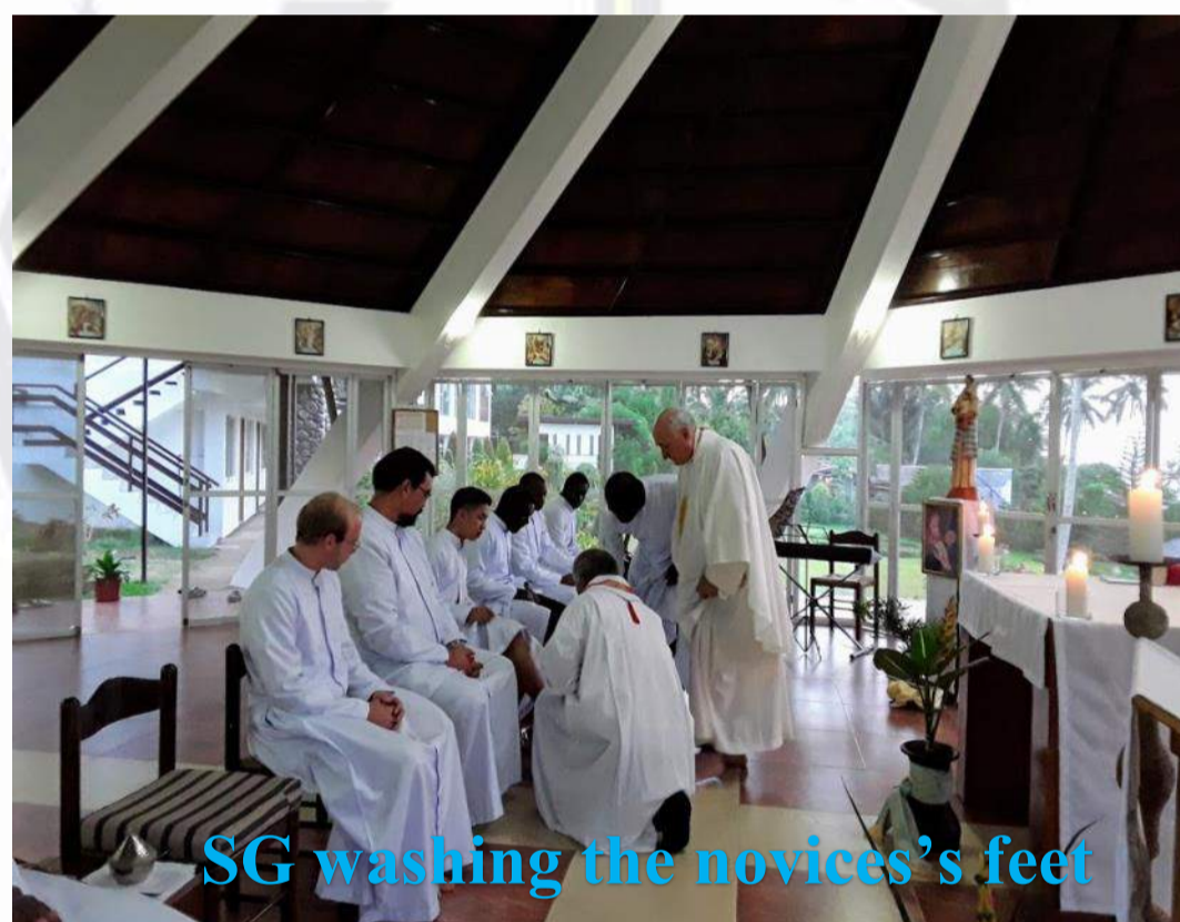
SG washing the novices's feet