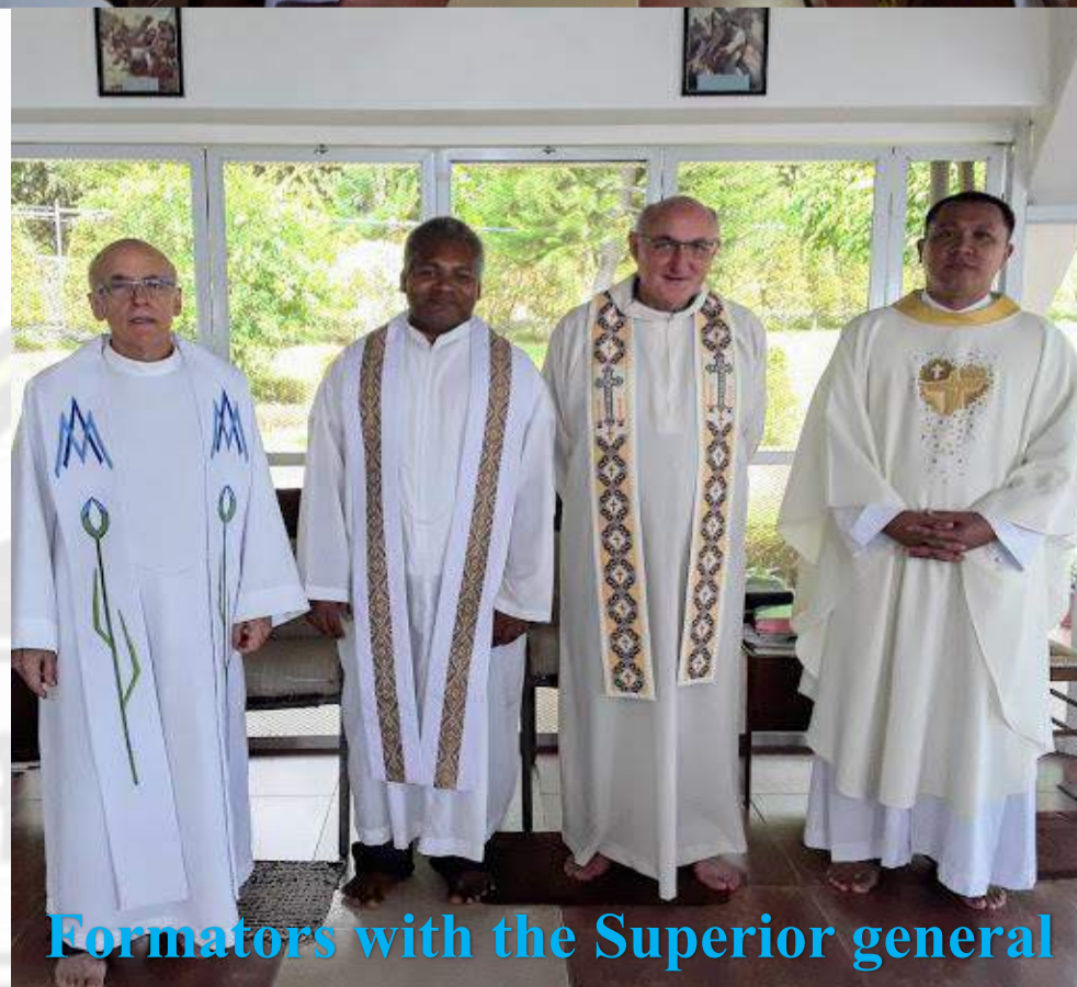
Formators with the Superior general