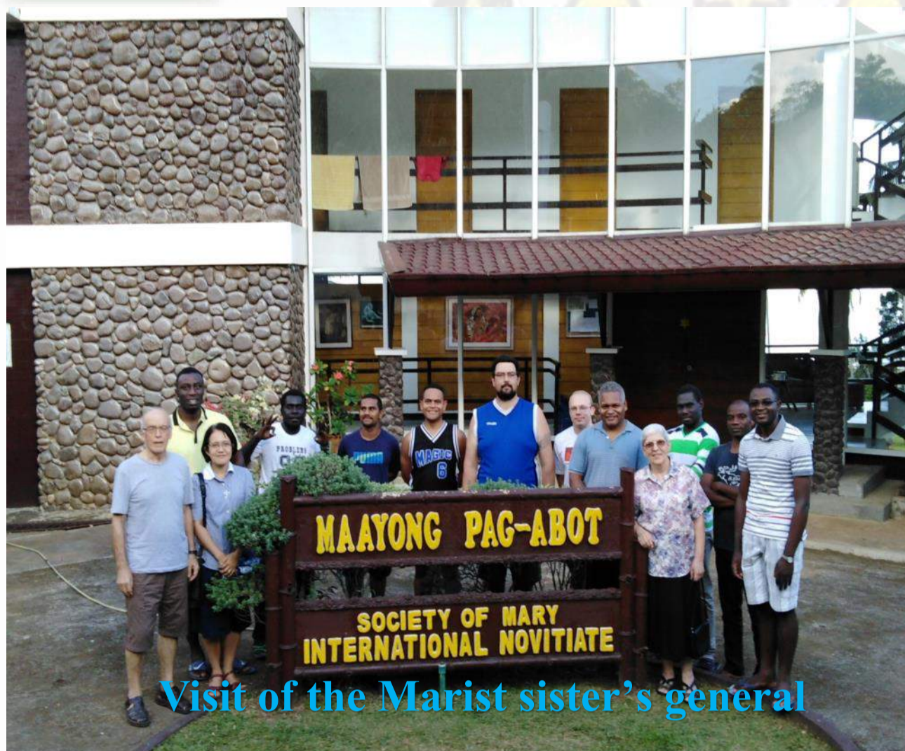
Visit of the Marist sister's general