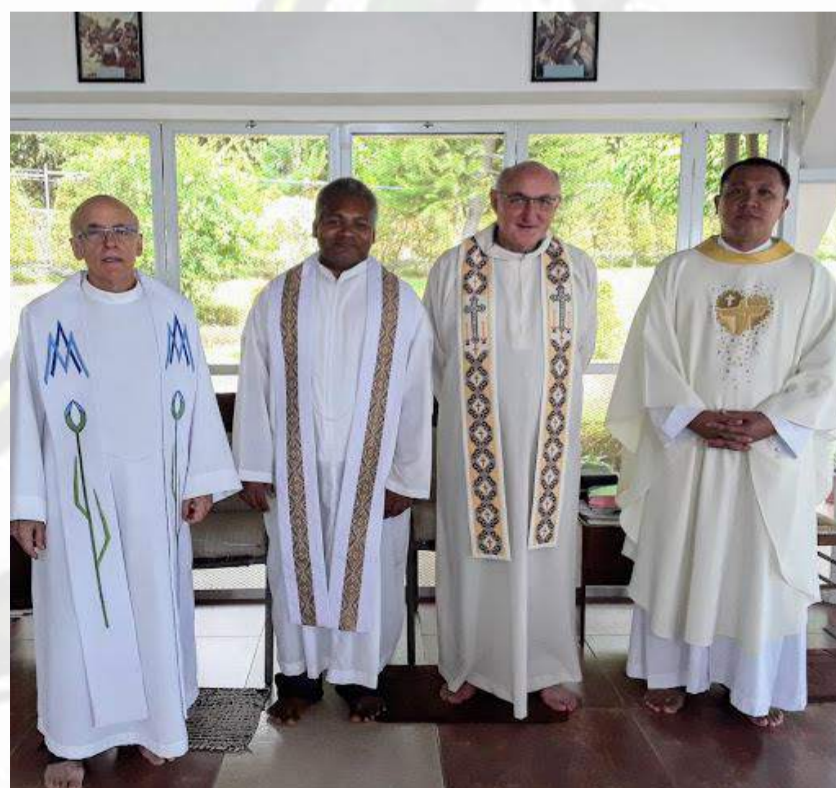
Superior General with the Formators after Easter Mass.