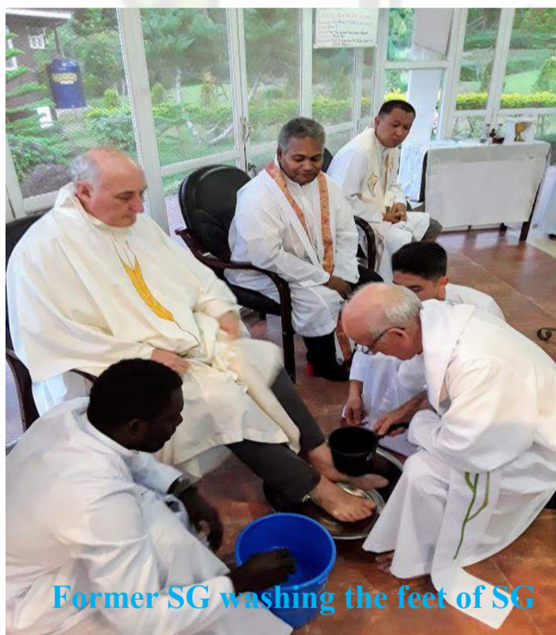
Former SG washing the feet of SG