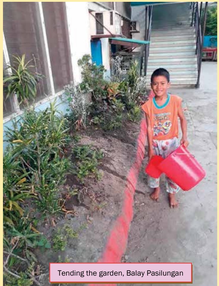
Tending the garden, Balay Pasilungan

With our sincere thanks for your generous support.