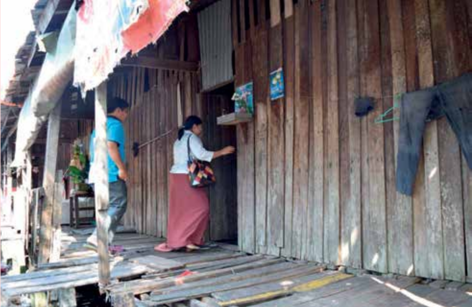
Left: Home health and help

HIV Aids Health Program: Extreme poverty and economic exploitation leads some people to misuse drugs and place their own and their family's health at risk. Eighty five patients and 195 family members are supported with home visits and education.