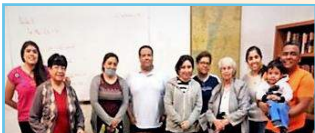
Participants in the Bible Course with the Council, Claveria Parish, Mexico City

Mission: Open to the Word of God and Mary's lifestyle, we strive to announce God's Kingdom, collaborate in the construction of a Church with Marian face, be attentive to the care of the humble, the small and the oppressed, accompany youth and be a benefit in the educational process.