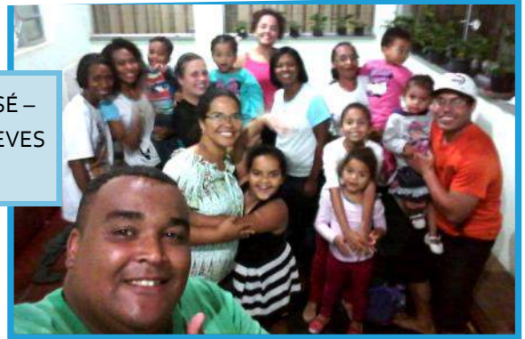
MADRE SÃO JOSÉ – RIBEIRÃO DAS NEVES - MG