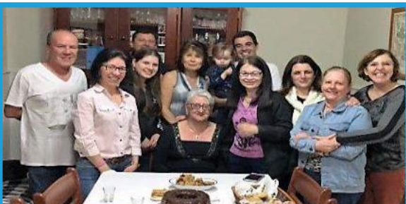
Light of Mary Group CURITIBA - PR