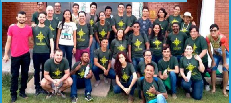
SM Vocation Day Rondolândia - MT - Participation of Marist Laity & Marist Brothers Ji-Parana- RO