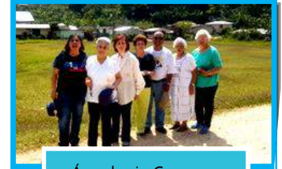
Ángeles in Carranza

We had the great opportunity to visit some villages belonging to the parish; "La Independencia", the parish headquarters, "Carranza", and the last more distant one called "Tierra Blanca". It was on this visit, we could see that the people need two hours or more, to go from one place to another. Their communities are countryside's and everything they eat are the fruit of their own labour, nevertheless there is lack. They live in unity and treat each other like family and even called us "Sisters". They invited us to enter their house of God. The way they live their faith is amazing, they always pray and express their gratitude for all God's gifts.