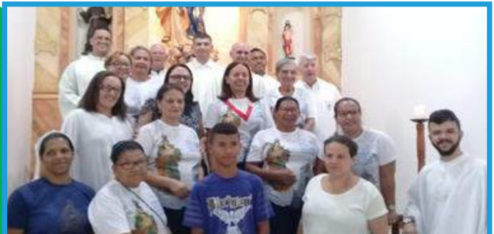
Walking with Mary Mother of God Palmos de Monte Alto—BA