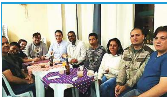
Lay Marists, Seminarians and Brothers Festa Madre SÃO JOSÉ