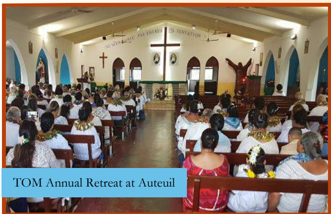
TOM Annual Retreat at Auteuil