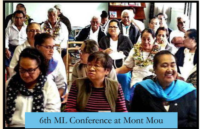
6th ML Conference at Mont Mou