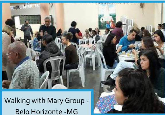
Walking with Mary Group - Belo Horizonte -MG

has its own characteristics. We live our Marist vocation principally in the places where we work and live. We are continuing to grow in understanding and deepening of the Marist spirit with the collaboration of Religious including Marist Religious. The monthly meetings are opportunities to share our lives and to strengthen our Marist identity and call. We are constantly encouraged and reminded about how good it is to be called in Mary's Marist family.