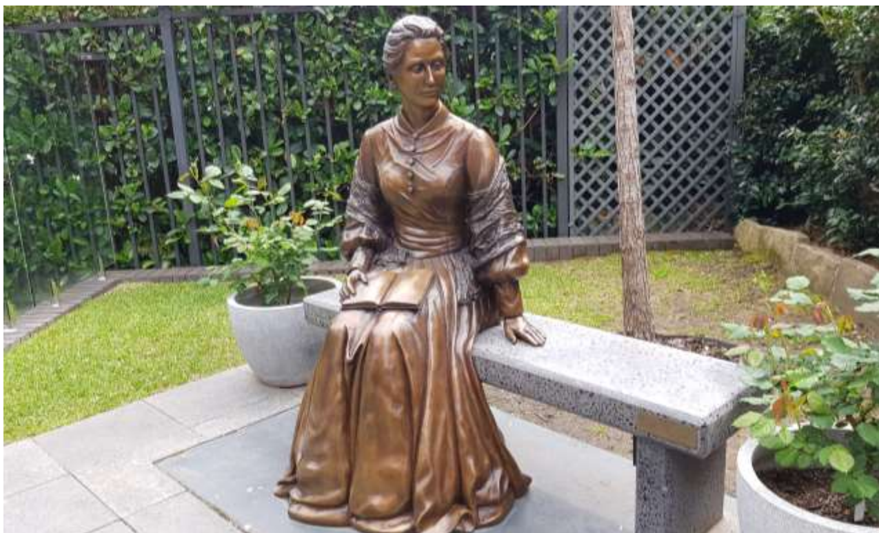
Sculpture of Catherine McAuley: "Come, sit awhile"

What practical commitment can I make to 'be' Christ by the way I listen?