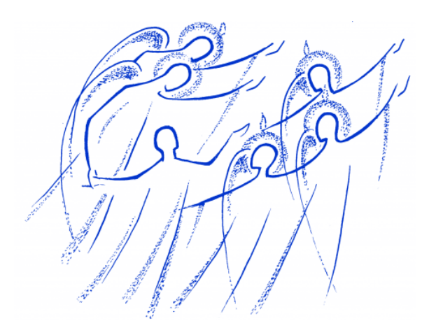
Ant. 2: If you, O Lord, should mark our guilt, Lord, who would survive?

Ant. The Lord will guard you from every evil, he will guard your soul.