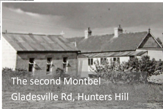
The second Montbel Gladesville Rd, Hunters Hill