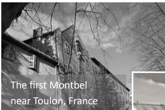
The first Montbel near Toulon, France