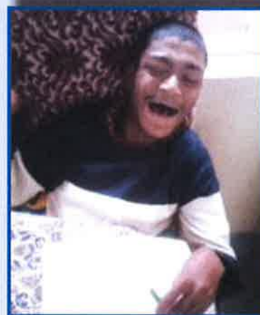
Right: Lovely smile

A 20 year old young man who is physically and intellectually challenged. He is bedridden and cannot provide self care or do anything by himself. His father has abandoned both him and his mother and so it is very difficult for his mother to care for him as he grows older. During Covid times the Centre has assigned a male assistant and female assistant to help with massages and exercises to support him while he is confined to his home.