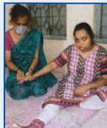
Above: Enjoying physical exercises

A 32 year old woman with physical and intellectual disabilities and epilepsy. She has limited mobility and falls easily. She likes to do colouring and writing but because of her vision impairment is finding it difficult to continue with these activities. Her mother is a nurse and is struggling to cope with her at times her demanding behavior. She enjoys company, doing physical exercises within the house, taking short walks and receiving phone and video calls from the Centre during Covid restrictions.