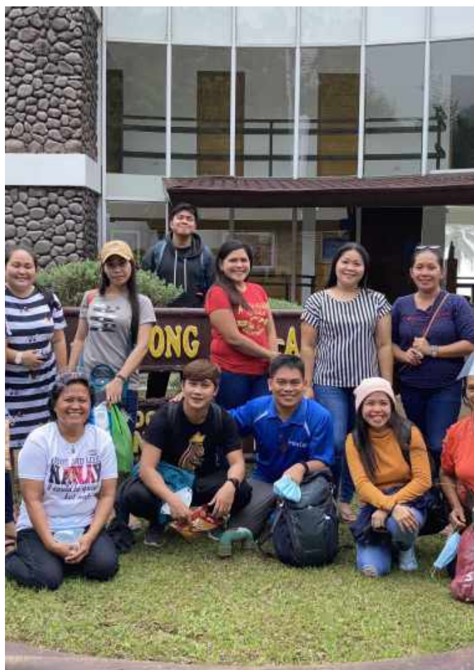
Balay Pasilungan Staff receiving input and training and bonding together as a team. Staff and Volunteers support 33 children in the Programme.

This year, the project of Balay Pasilungan will be extending its support to the boys who will reach the age of 15. (The Balay Pasilungan has been a home to street boys from 5 to 14 years of age.)