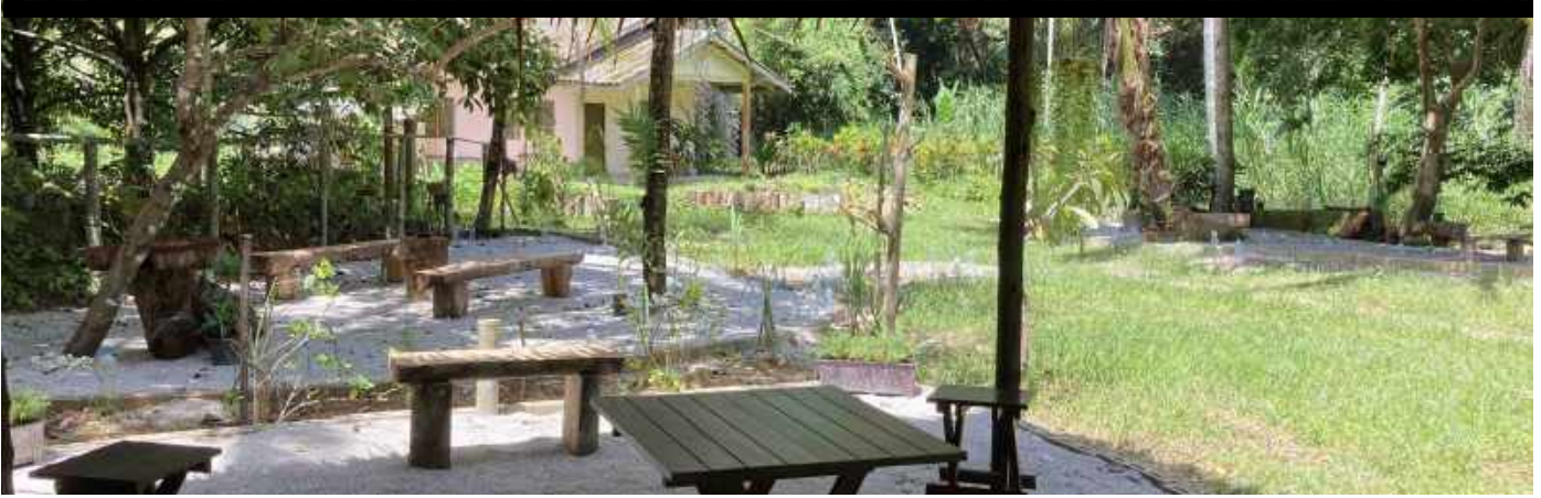
The Harmony Centre under development in Ranong to promote the IRIC Programme at Marist Asia Foundation