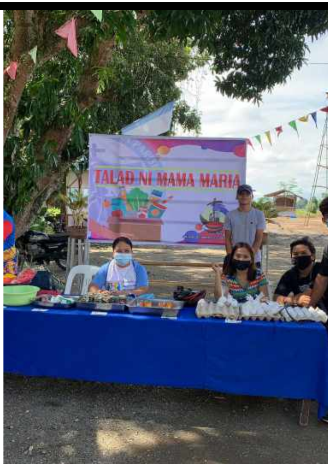
(left) Parish Celebration of St Peter Chanel, (right) Parish Celebration of Mary's Market to support the Parish Food Pantry in Digos