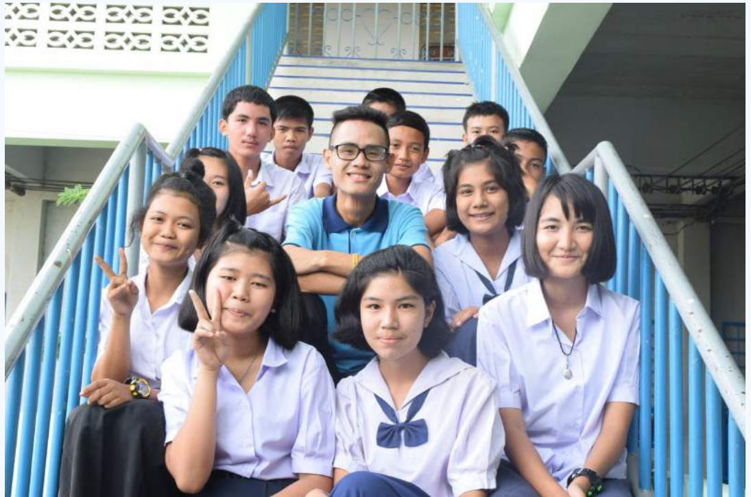
Above: Burmese Migrant Secondary Education Program

These young people are now accredited to teach and are a huge inspiration to other students. They commenced as young students themselves at MAF in a country where as refugees they are unwelcome and experience discrimination. The gift of education inspired them to hope for a future.