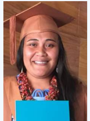
Left and Right: Senior students graduate in style