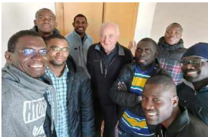
Pre-Theologians with Superior General