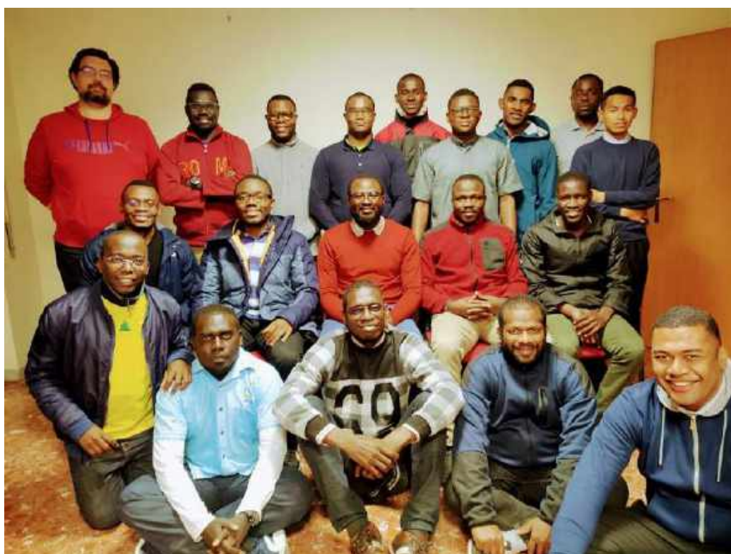
Seminarians at Casa di Maria