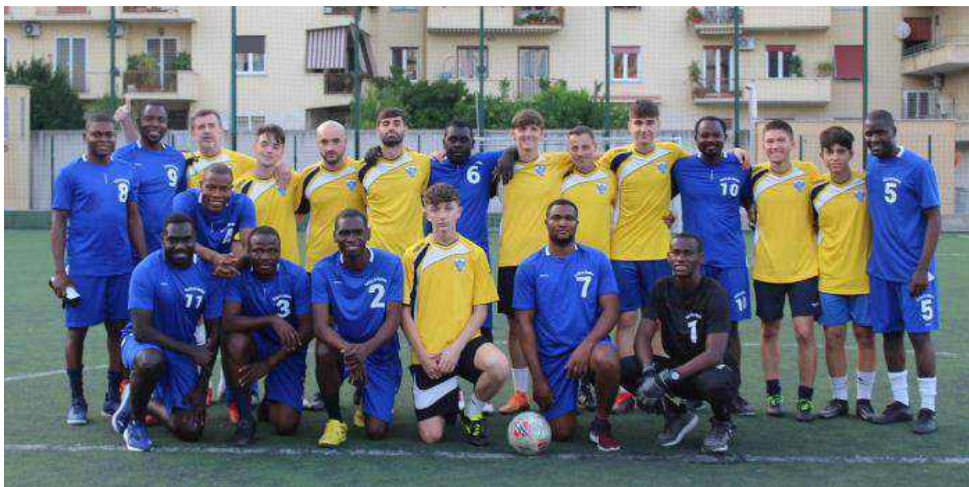
Friendly football match against some youth from Santa Francesca Cabrini Parish.