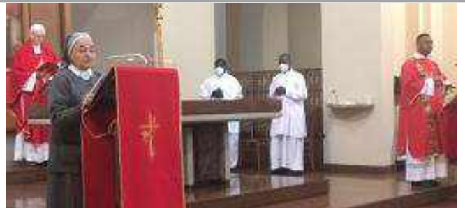
Proclamation of the Passion on Good Friday

This was the first Holy week for us in Rome given that we had just arrived. It's a new experience as we hailed from different parts of the world namely Oceania and African