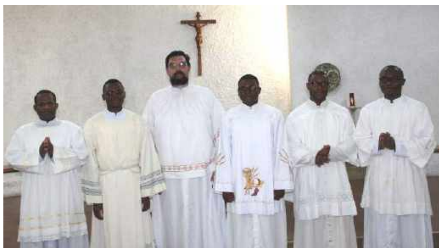
The new lectors