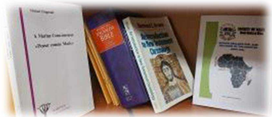
Some useful tools to keep the brains awaken