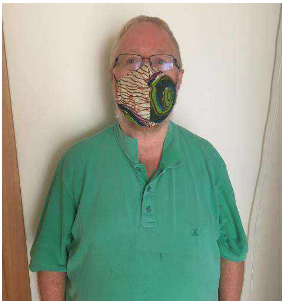
Father Superior too was not left out.