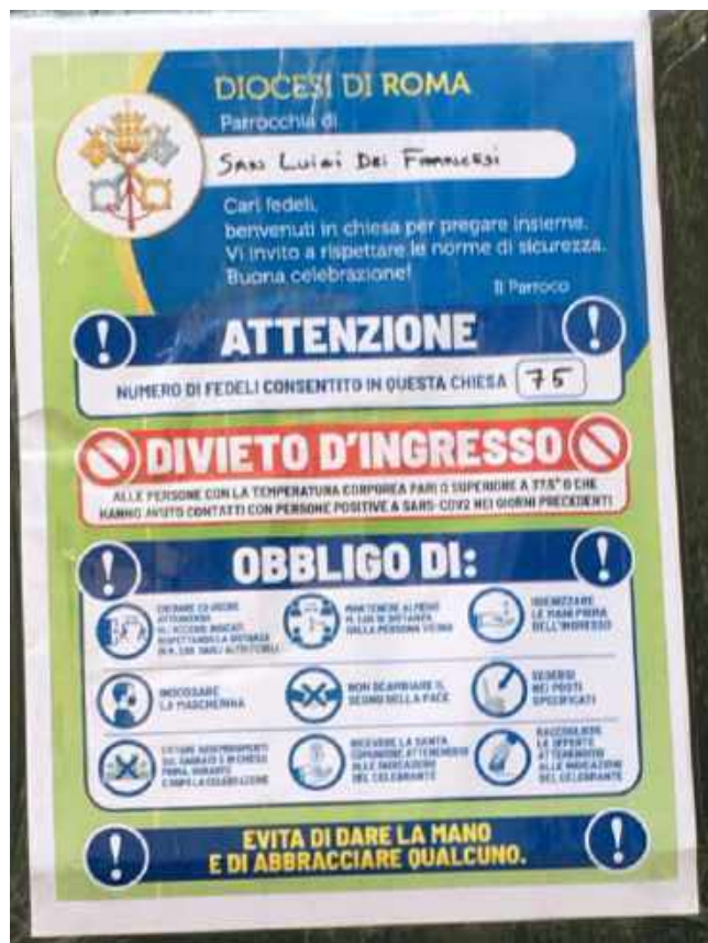
Rules for entering a church