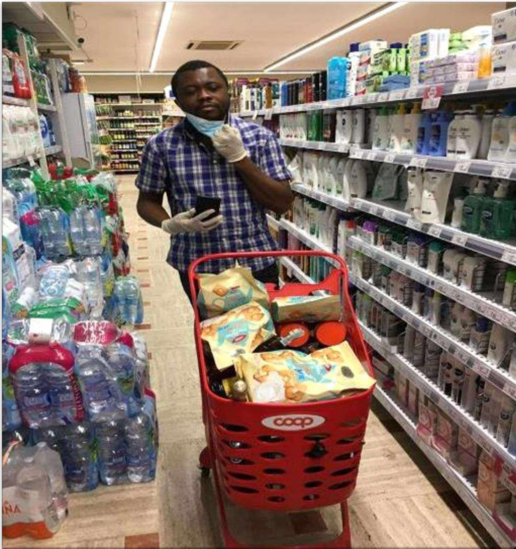
Brother Charles shopping for the community during quarantine.