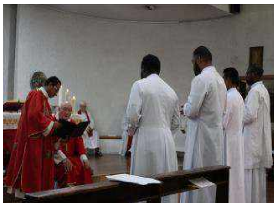
Prayer of blessing for Acolytes