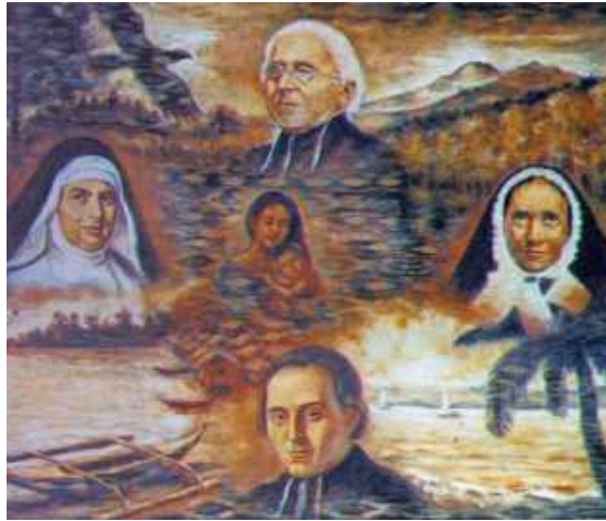
Four Marist Founders with Mary & Child-Jesus