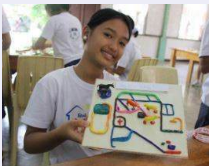
Above: Play Therapy