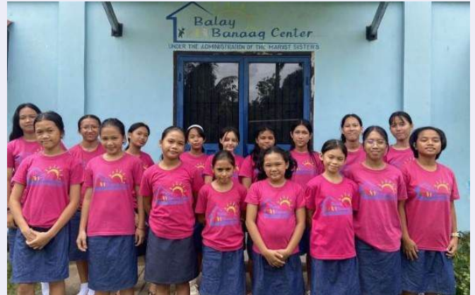
Above: A safe place to live and learn

A special feature at the Centre is the Basic Skills and Therapeutic Program. There is a well-established program for learning the basic skills of self-care, house cleaning, group living, landscaping, gardening and social outings. The girls also participate in personal awareness and development programs via activities such as play therapy and story-telling.