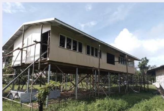
Above: New Classroom under construction