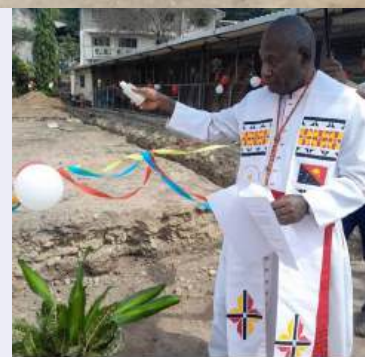
Right: The blessing of the building site