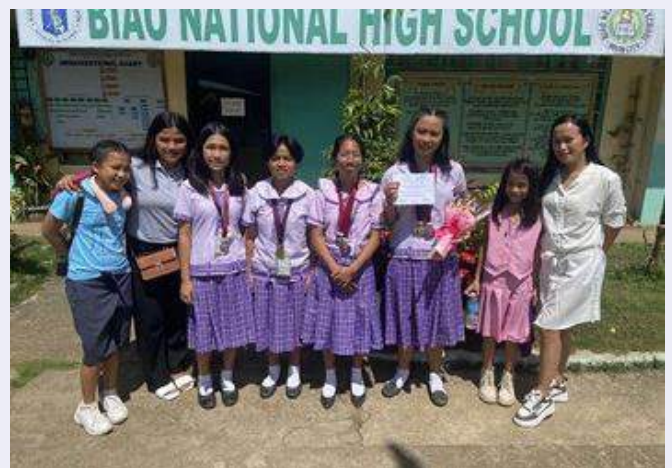
Above: High School