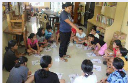
Above: Story of my life