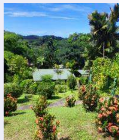
Right: The relaxing gardens of the centre