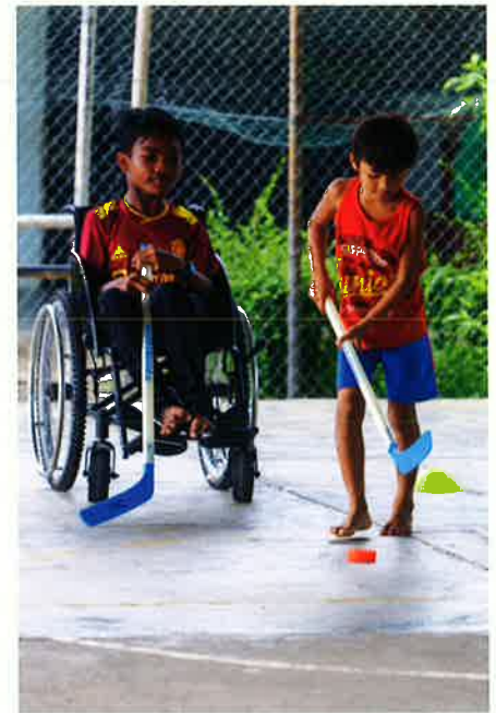
Above: Students at Play

La Valla enables the students to gain independence, self confidence and to break down social barriers.