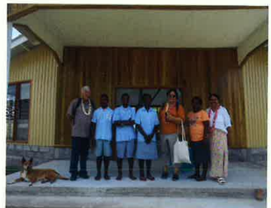
Above: Visiting San Isidro

The Centre is located in a rural area and the students learn sign language, social, agricultural and living skills to enable them to take an active place in their own communities.