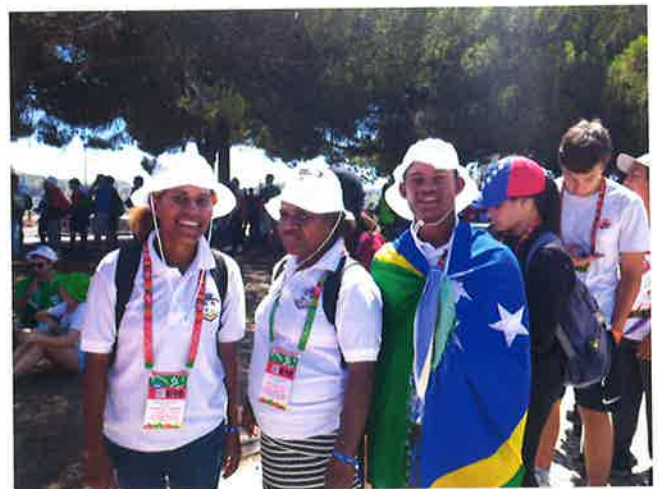
Right: San Isidro Participants

These young women will become leaders in their home communities.