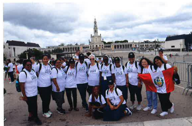
Left: WYD Visit to Fatima

They came from the Solomons, Samoa, Philippines, Madagascar, Senegal, USA, Peru and Sri Lanka.