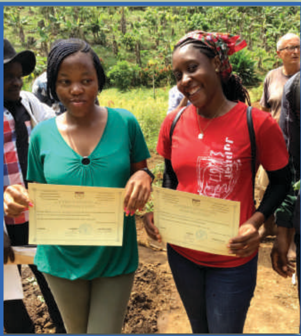
A Future with Hope

Left: Twenty young people have graduated with a 'Certificate of Professional Competence'. These young people who all come from poor villages will now return to their home communities to set up a community based Agri-Poultry project.