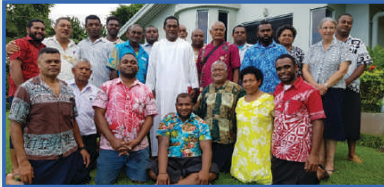
A time for prayer during Covid-19

The prayer centre is an oasis for the people of Suva and this is especially so during the time of Covid-19. After the initial shock of lockdown in the first part of the year, there was an increasing demand for retreats and days of reflection. People from all parts of the community were seeking spiritual nourishment, including families, lectors and Eucharistic ministers, lay people, priests and religious. The ministry of meditation in schools also continued during 2020.