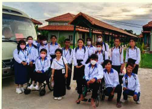
Right: Students leaving for High School

There were 38 female and 29 male students staying in Hostel accommodation at LA Valla.