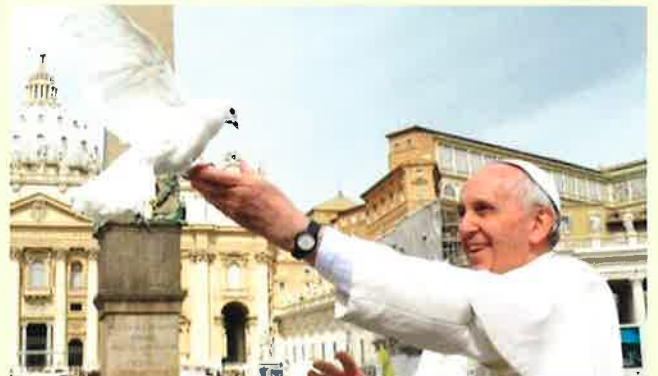
Right: Pope Francis "Peace be with you"