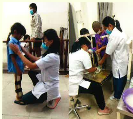
Right: Students receiving new prosthesis

Summer heat can be very hot in the school buildings. MMC has recently funded a project to replace the old roofing on two buildings housing the Computer Classroom, Library and Administration Offices with new roofing material and to insulate the buildings.