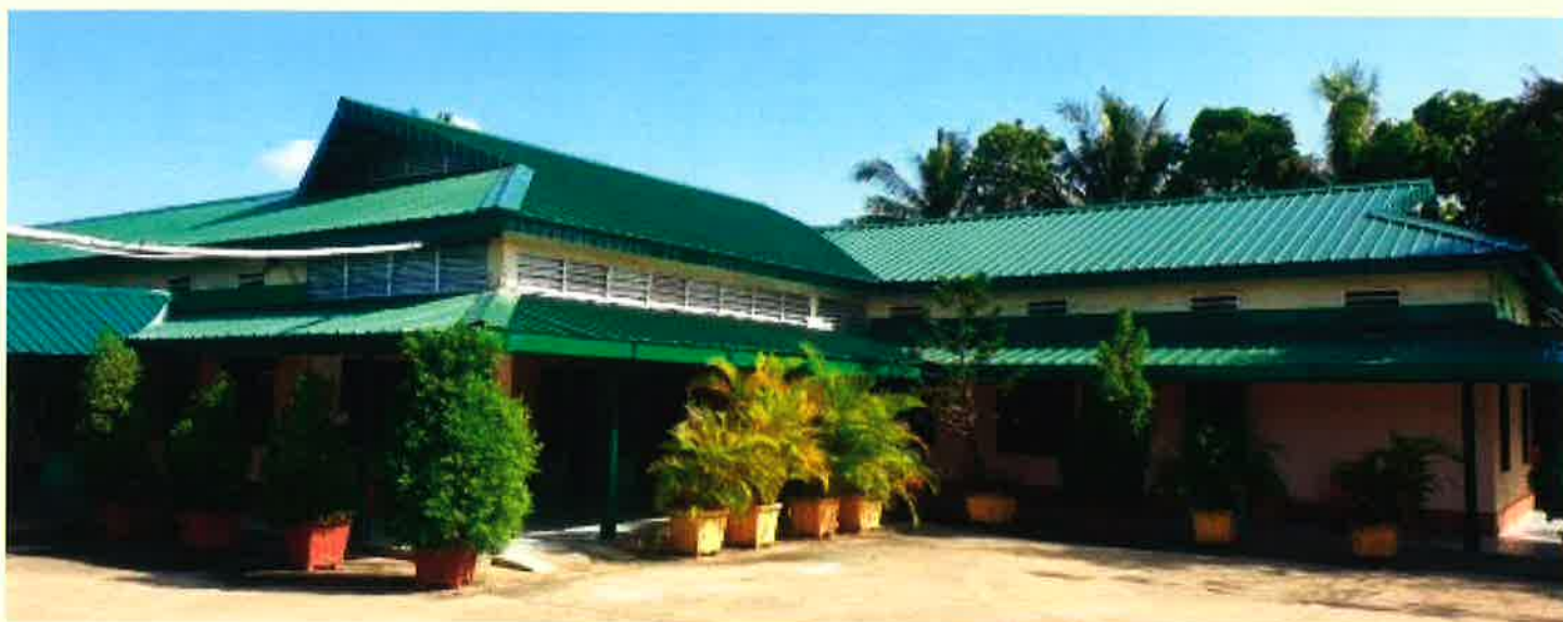
Above: New replacement of roofing and insulation of buildings

In December 2022 there were 28 female and 25 male students attending the school from the local communities including 3 University students and 5 involved in Vocational training.