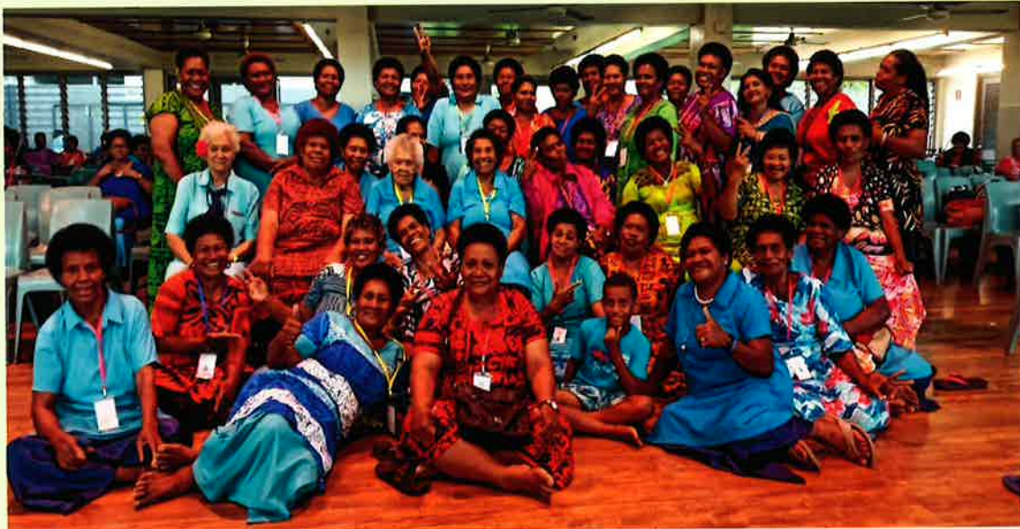
Above: Sharing and supporting each other

MMC helped to sponsor the Catholic Women's League, Fiji, Annual Conference held in Suva on October 7-9, 2022. Approximately 3,000 women from all Parishes in Fiji attended the Conference. One key aim of the Conference was the empowerment of women at all levels in their communities and parishes.