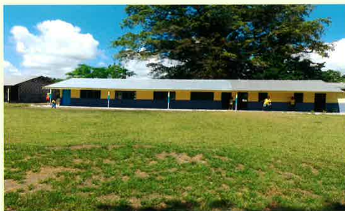
Above: The old and the new