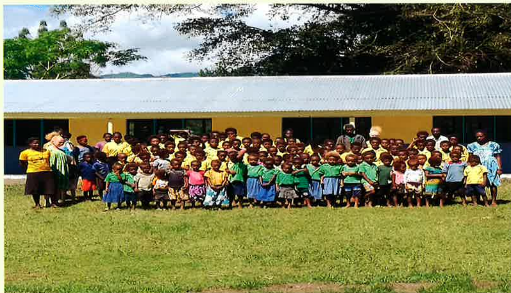
Above: Little people with big hopes

Big Bay is located in a remote and isolated area where the villages are scattered both on the coast and inland. There is no access by road and it is difficult and dangerous to access by sea.