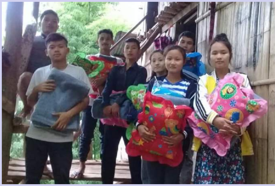
New dreams for Refugees