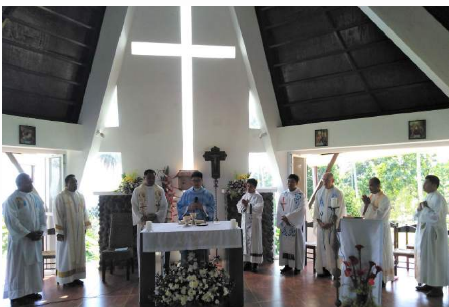
SM Priests at the First Profession Mass