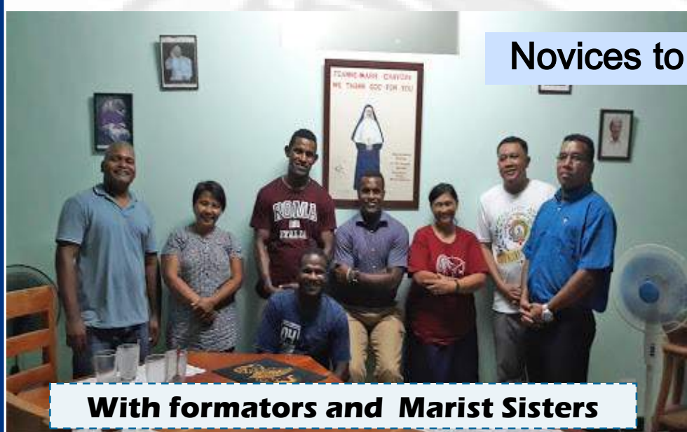
With formators and Marist Sisters