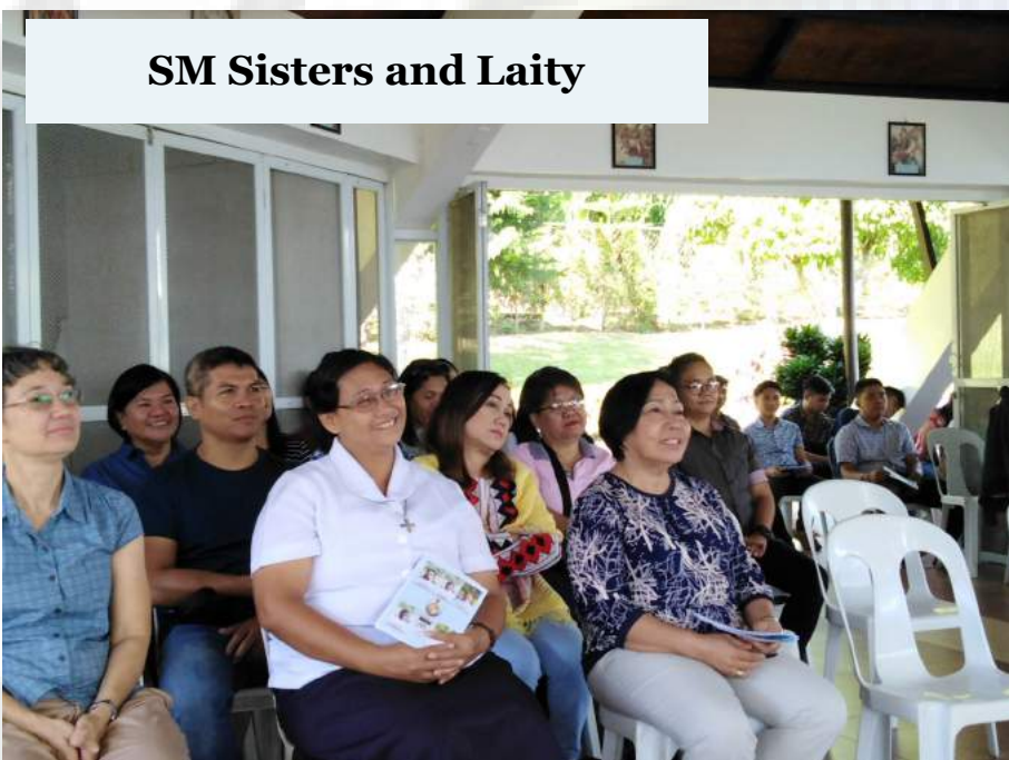
SM Sisters and Laity