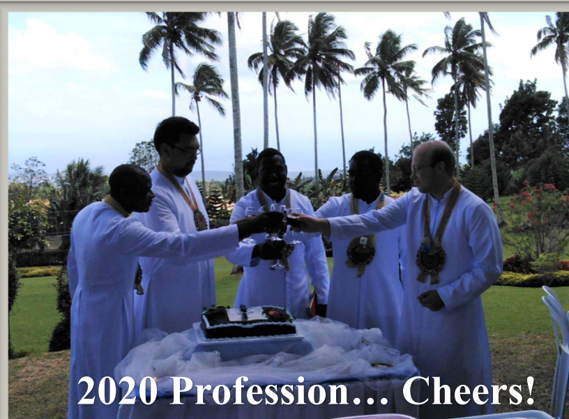
2020 Profession... Cheers!