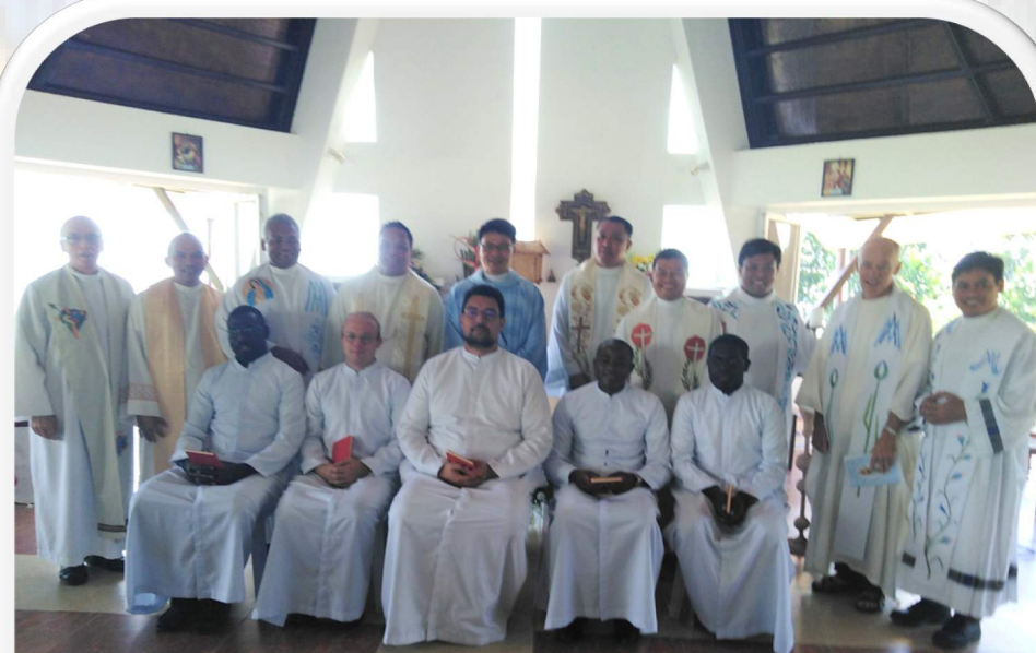
Newly Professed with SM priests