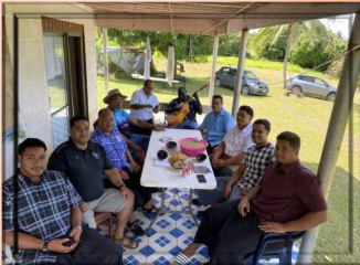
The Tonga Sector confers with the "Come and See" candidates in their Vocation weekend program.