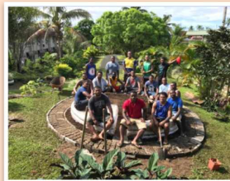
Earthbag technology for making raised beds